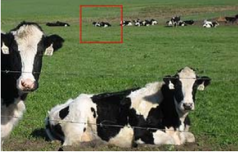
Figure 2. Inductive instance annotation with context – “What class is the region of pixels inside the red box?” This image is from the VOC12 data.

image contains labels “cow” and “grass,” we do not need to see the rest of the image to conclude that the label for this instance should be “cow.”